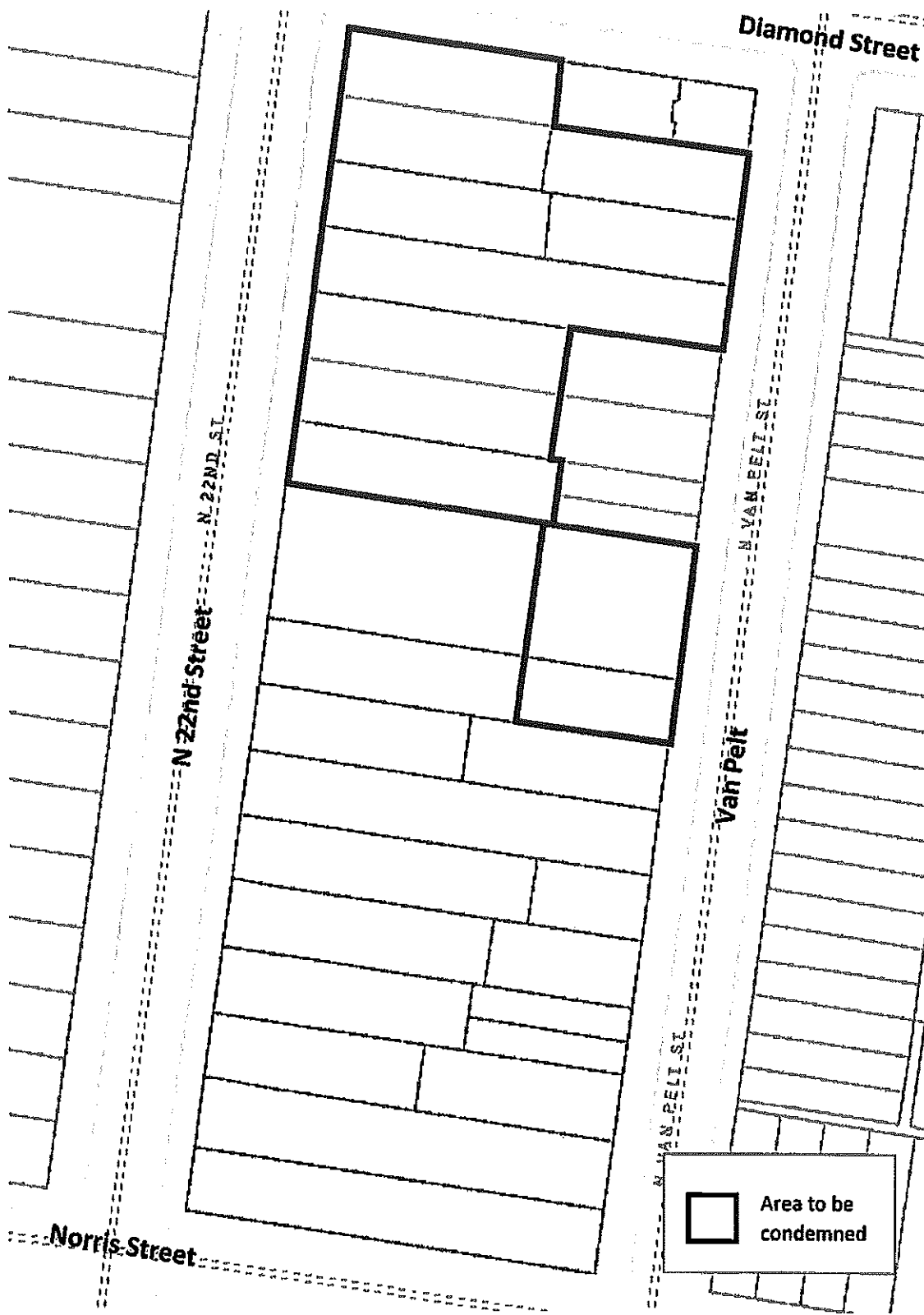
Exhibit A - Area A