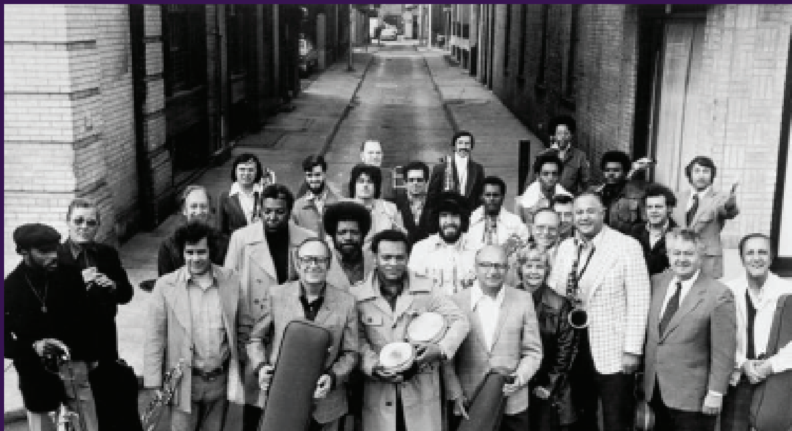
Philadelphia International Records

4. Redevelopment of Sigma Sound Studios building (212 N 12th Street) Redevelop the original Sigma Sound Studios building (in Chinatown) into a creative music headquarters for Philadelphia's music community and newly established Philadelphia Music Office. There is already an effort underway to preserve and develop the property into a new space, which would include a new music venue and cafe/lounge on the ground floor, gallery space with rotating exhibits, recommissioning the original recording studio (2nd floor); and most importantly office space for the new Philadelphia Music Office. Having the city's support to operate a new facility like this would speak volumes about the city's commitment to its musical roots and the existing music arts community. A space like this could provide educational and cultural programming for the surrounding neighborhoods and schools and also has potential to generate significant tax revenue for the city.