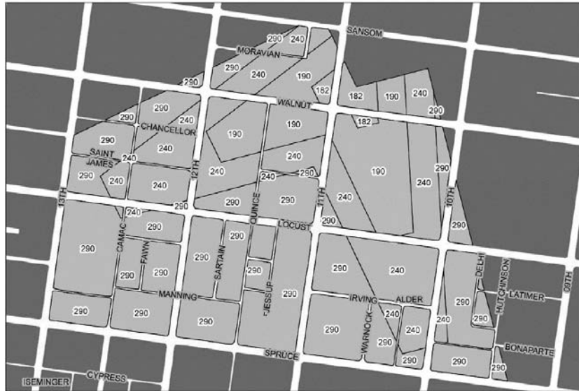
Heliport Hazard Area Map - Thomas Jefferson University Hospital Heliport Area