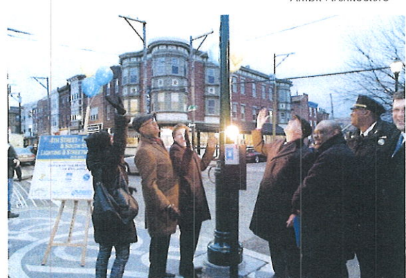
South Street Headhouse District