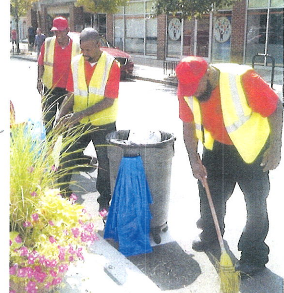
South Street Headhouse District

• In an ongoing effort to keep the district free of vandalizing graffiti, SSHD employs an SSHD-based business, Graffiti Removal Experts (GRE) , to remove graffiti, paint tags, and adhesive stickers from signs, parking kiosks, light poles and other public spaces at least three times per week. In 2016, with encouragement from SSHD, GRE hired a