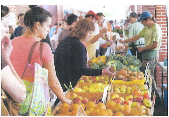
The Food Trust