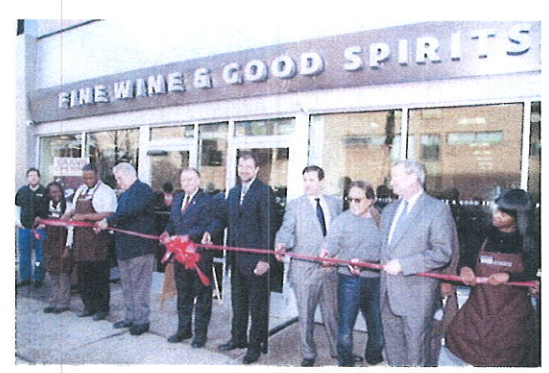
South Street Headhouse District