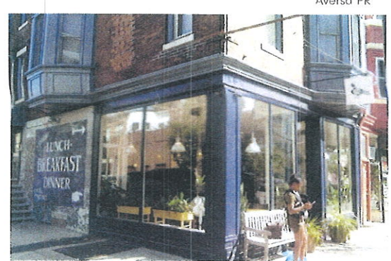
South Street Headhouse District