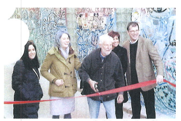
South Street Headhouse District

increase its decorative lighting program for the holiday shopping season. New holiday lighting was placed on 150 pedestrian light poles, which, along with illuminated wreaths, banners, bows, and a giant 25-foot Christmas tree, helped transform South Street and Fabric Row into a festive holiday destination.