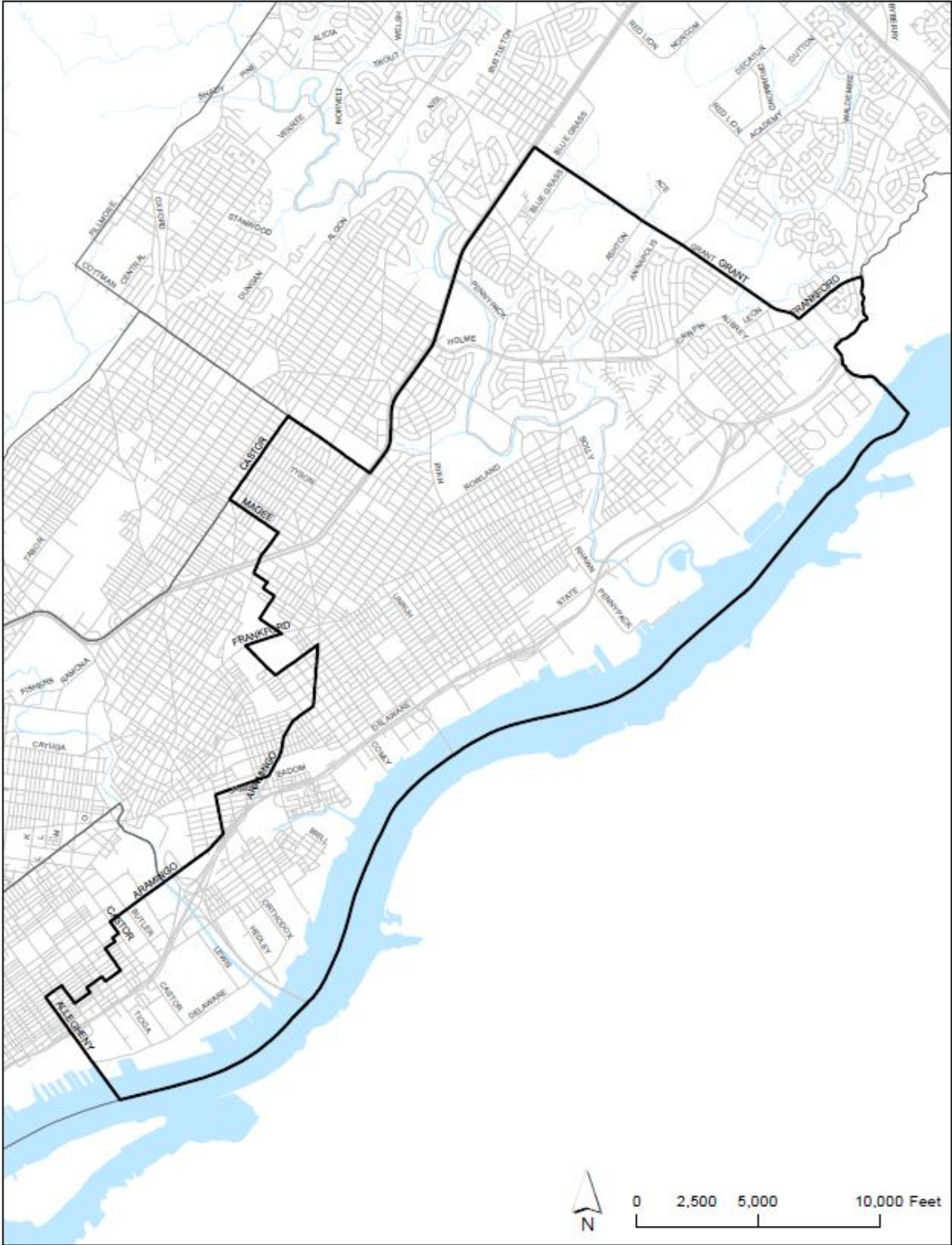
Family [Day] Child Care Area 1 (Applies to all lots)