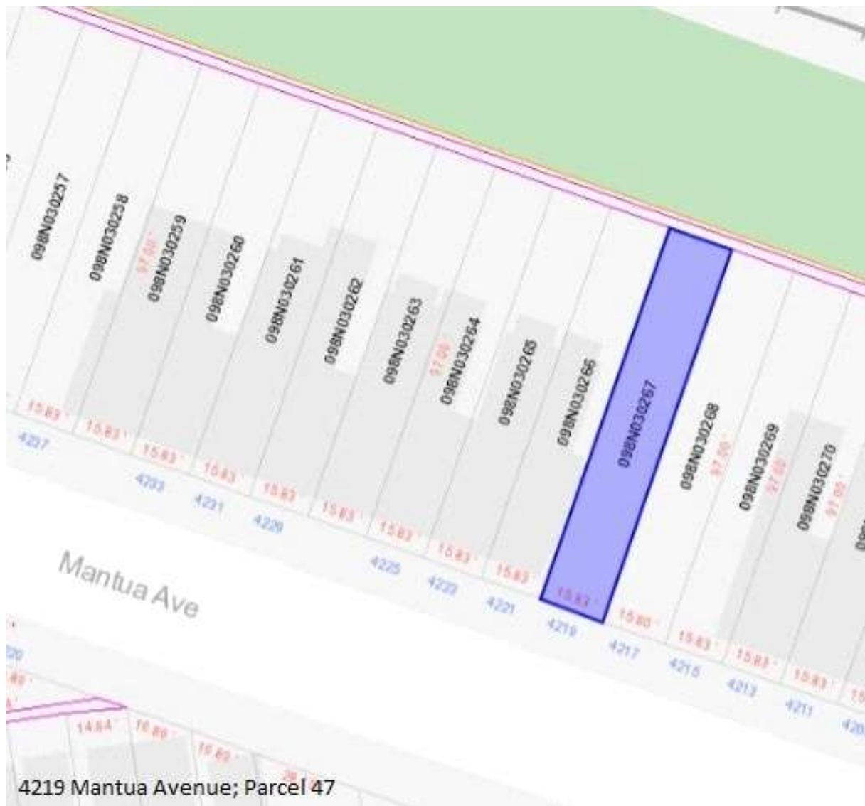
4219 Mantua Avenue; Parcel 47