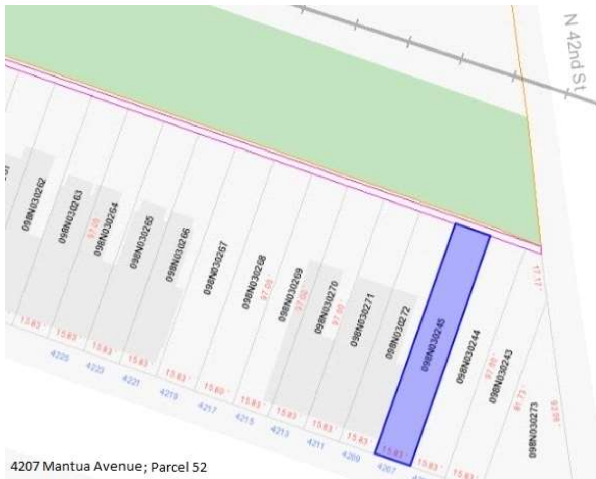
4207 Mantua Avenue; Parcel 52