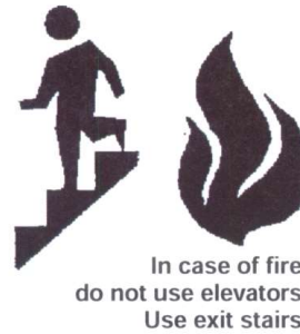
ELEVATOR CALL STATION PICTOGRAPH