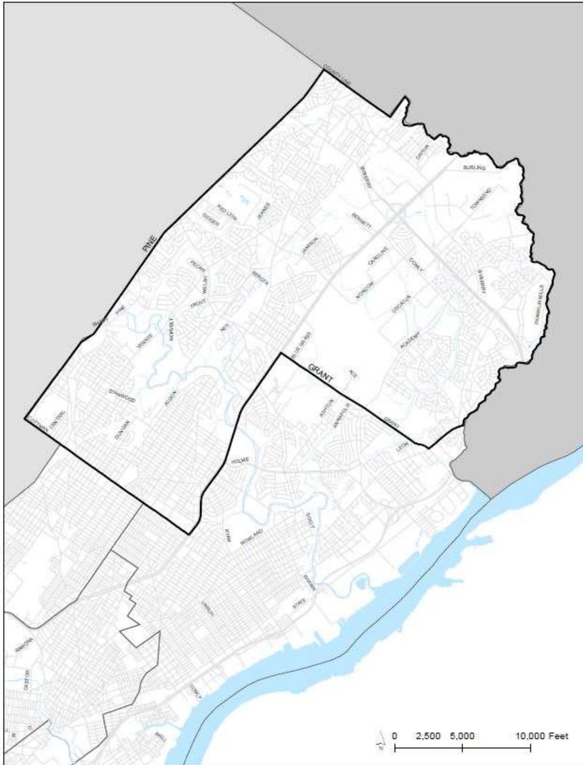
Family [Day] Child Care Area 2 (Applies to all lots)